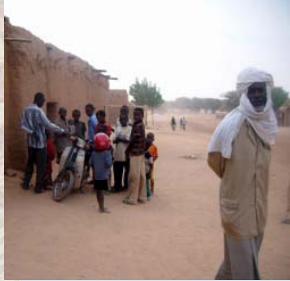
Where the road ends and the work begins.